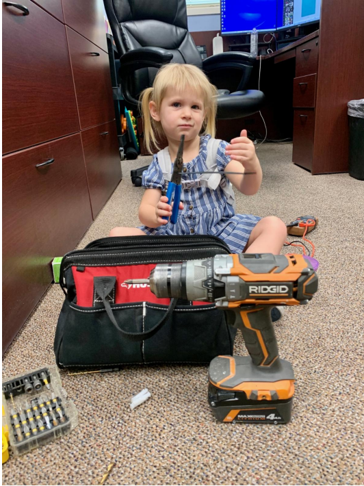
The newest member of the facilities team--helping dad with the smoke detector installation.